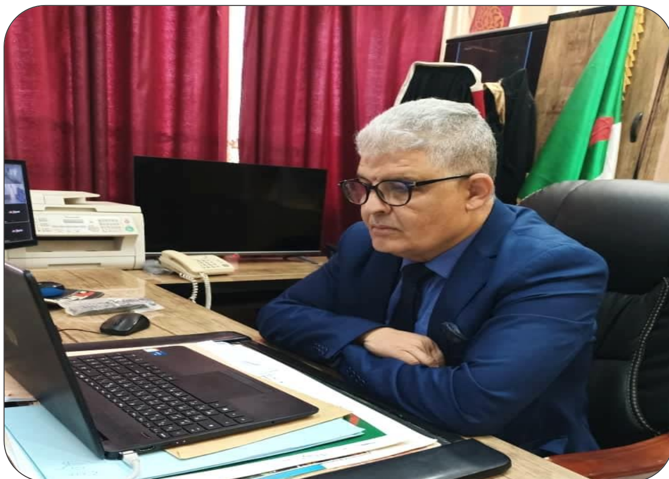
University of El Oued Rector Inaugurates Southern Seminar on "Learning Poverty"